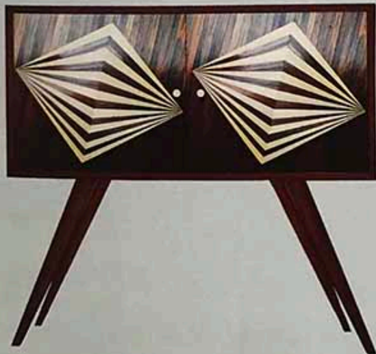
FEATURE LUISA FERDINZI | FASHION ILLUSTRATION GETTY IMAGES

Such one-off pieces are inevitably expensive, but the trend is already filtering down to the mass market, with a screen-printed pop-art design on a cabinet called Viola included in the spring collection from Habitat, habitat.co.uk. Even Ikea, ikea.com/gb, is offering its Stockholm cabinets in new bold blocks of colour. ■